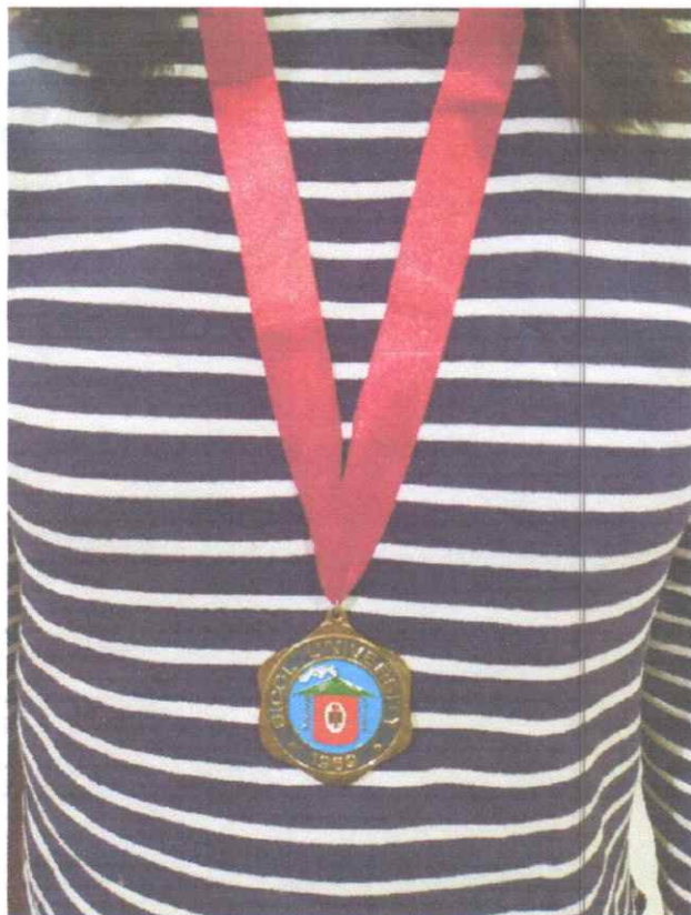
Magna Cum Laude - Gold (Red Ribbon)