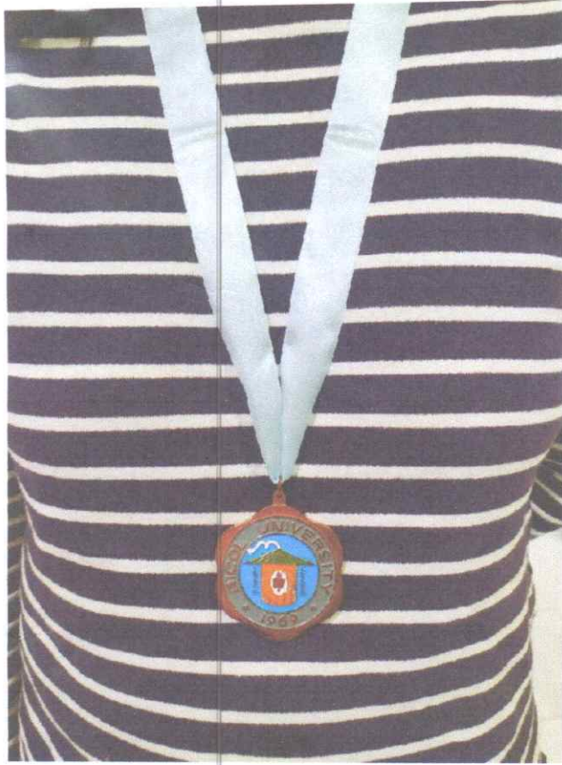
Academic Distinction - Bronze (Blue Ribbon)