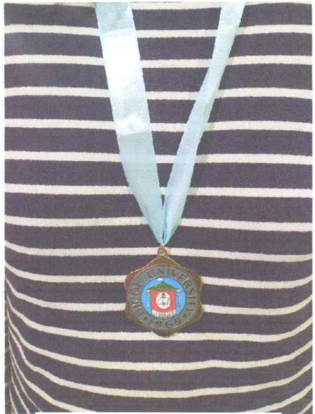
Cum Laude - Silver (Blue Ribbon)