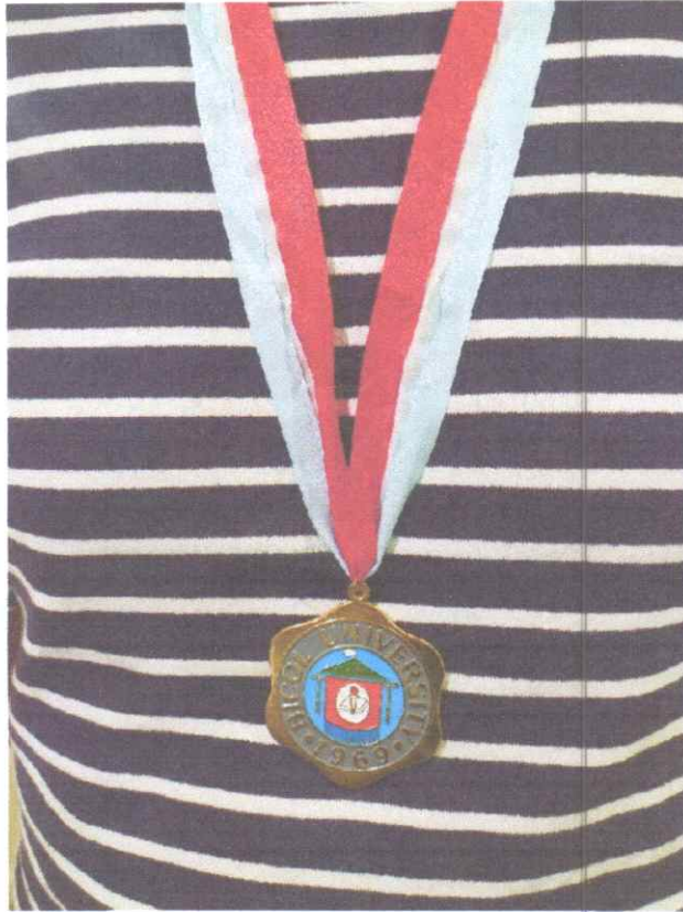
Summa Cum Laude - Gold (Blue, White & Red Ribbon)