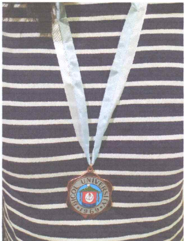
Academic Distinction - Bronze (Blue & White Ribbon)